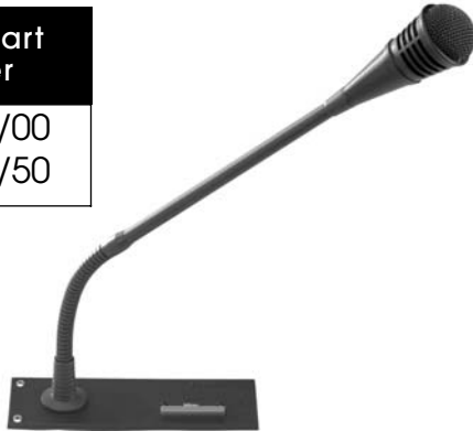
LBB 3537/00 shown