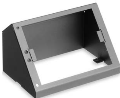
Table-Top Housing for Loudspeaker LBB 3538/00 and Two Flush Mounted Units

This housing enables the loudspeaker LBB 3538/00 to be used in table-top applications. The loudspeaker simply clicks into place in the housing, which is designed so the loudspeaker is facing the delegate, thus increasing intelligibility. It can also be used to mount two flush-mounted units e.g. the LBB 3537/00 microphone and LBB 3524/00 channel selector. For permanent applications, the housing can be fixed to the table-top by means of two screws.