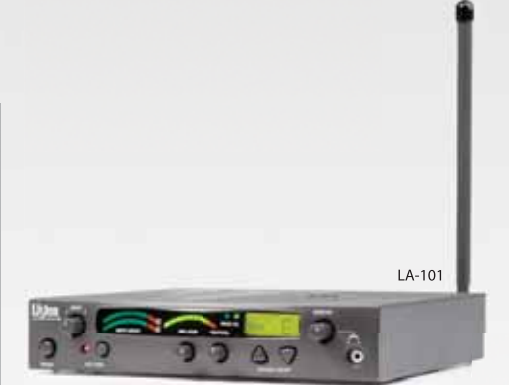
The LA-123 90° Helical antenna is a simple solution for limited transmission range applications.

A solution for your remote antenna needs for the LT-800 (863 MHz). The kit contains monopole and dipole antenna options; and hardware to mount on a wall, electrical box, and horizontal surface (flat and inverse), inside a wall or ceiling. Includes 25 ft. (7.6 m) of RG-58 coaxial cable.