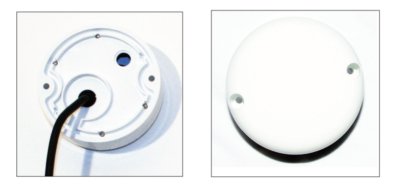
LGC- 4000 Module, bottom view (left) and top view (right).

All Lowrance NMEA 2000 capable devices are either NMEA 2000 certified or certification is pending. See our web site for the latest product status information.