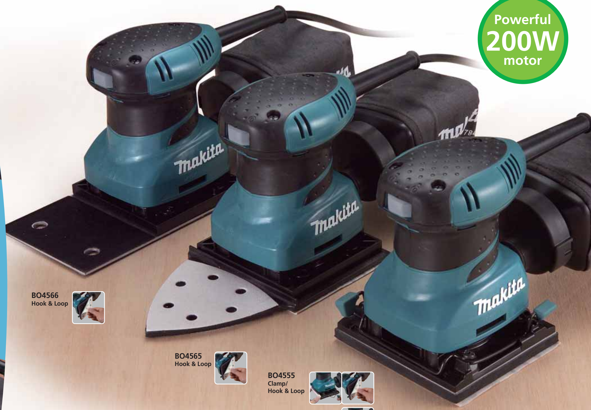
BO4566 Hook & Loop

Ergonomic shape of the tool head designed based on research of palm sizes.