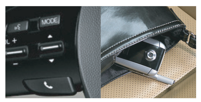
Download from Www.Somanuals.com. All Manuals Search And Download.