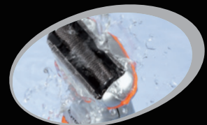
Wet & Dry