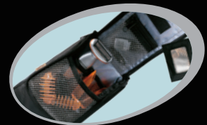
Included carrying bag