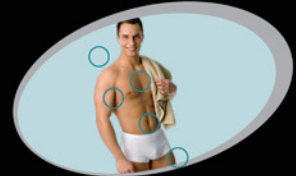
All-in-one trimmer -for all bodyzones