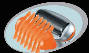
Distancecombs (2 and 4 mm)