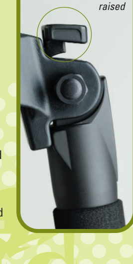
Fig 5 Leg angle adjuster

due to the wide diameter, or footprint spread, of the extended tripod.