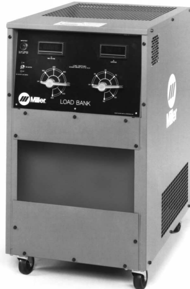
Welding Power Load Bank

The welding power load bank is designed to load test the output of transformer-type, engine- or motor-driven generator welding power sources. This portable unit can be used to test AC or DC welder outputs, and to demonstrate welding equipment to prospective customers.