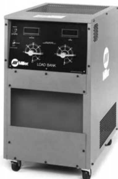
Welding Power Load Bank

The welding power load bank is designed to load test the output of transformer-type, engine- or motor-driven generator welding power sources. This portable unit can be used to test AC or DC welder outputs, and to demonstrate welding equipment to prospective customers.