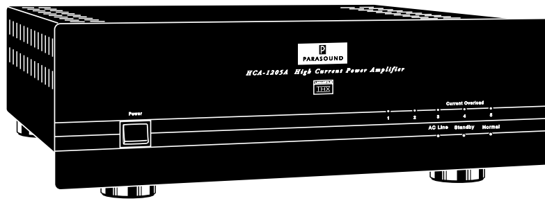
HCA-1205A Five Channel High Current Power Amplifier