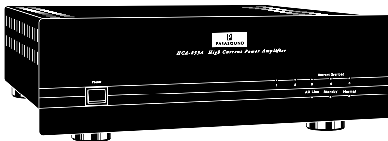
HCA-855A Five Channel High Current Power Amplifier