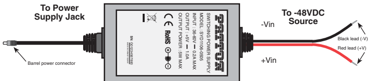
Figure 1. DC Power Supply

The 36-60 VDC DC to DC adapter is supplied with the DC version of the Model 3088A. The black and red leads plug into a DC source (nominal 48VDC) and the barrel power connector plugs into the barrel power supply jack on the 3088A. (See figure 1 ).