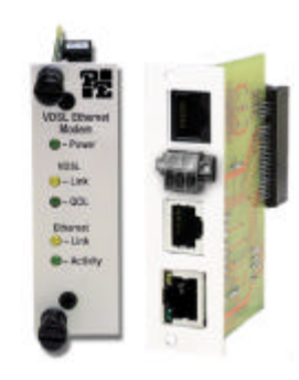
Model 1058DV and 1058DVRC