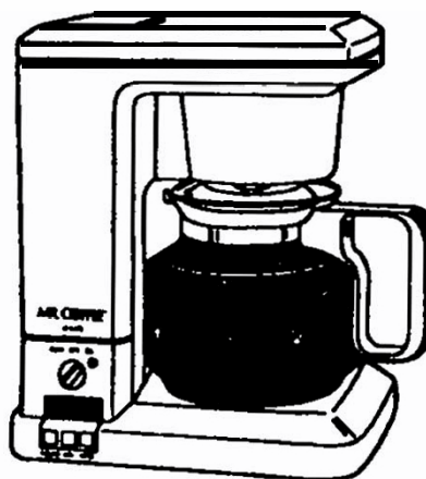
TRX20 12 cups

IMPORTANT: Please Read Before First Use The clock on the TRX20 model must first be set, before the coffeemaker will operate.