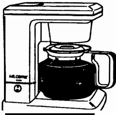
TR10 10 cups