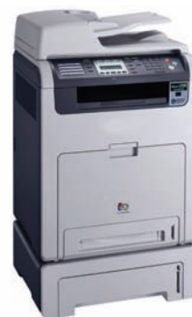
MFX-C2500 Professional Edition shown with 2nd cassette

Muratec America, Inc. 3301 East Plano Parkway, Suite 100, Plano, Texas 75074 For more information on Muratec products or services, call (469) 429-3300 or visit our web site at www.muratec.com