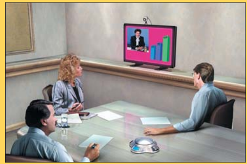
Corporate. Deliver a presentation they'll remember using the LCD3000. Ideal for board rooms, conference rooms and large offices, this monitor's ability to display crystal-clear text and precise images adds clarity and profoundness to spreadsheets, documents and graphics-based presentations. Picture-in-picture capability allows your group to simultaneously view multiple applications, such as a spreadsheet and full-motion video conference.