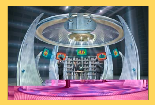
Tradeshows. With a multitude of exhibitors vying for the attention and time of tradeshow visitors, it can be difficult to stand out from the crowd. The LCD3000 helps your exhibit become the center of attention with its amazing screen performance. Its brightness and dynamic design will draw interest, while Rapid Response and a high contrast ratio allow you to effectively demonstrate your company's message. The lack of permanent phosphor image burn-in extends the monitor's life and protects your investment.