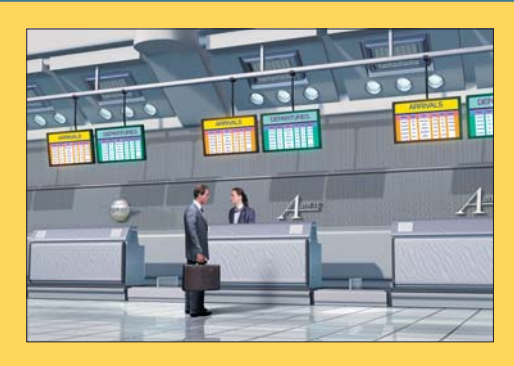
Information Display. Make a lasting impression on the public eye with the LCD3000. Whether this display is placed in airports, train stations, restaurants or kiosks in any interior environment, its spacious screen is guaranteed to turn heads and feed useful information to passersby. With XtraView wide-angle viewing technology, it doesn't matter if they're directly in front of the screen or passing by—an ideal view is assured.

And you thought LCD monitors were used only on desktops. With space conservation a major concern for all types of markets in today's business world, the LCD3000's space-conscious design allows it to fit comfortably into almost any application for maximum impact to viewers. Wall mounting, custommade cabinets and hanging fixtures are just a few of the options you have when choosing your display installation for this 30" (29.5" VIS) LCD monitor.