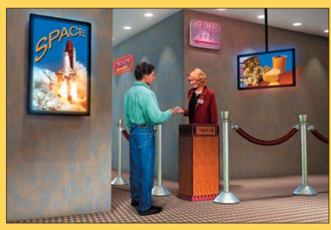
Advertising. With its high resolution, bright display and lifelike colors, the LCD3000 is unrivaled in drawing consumer attention. Spread the word on your products and services to moviegoers, advertise the latest sale items at a department store or attract the eyes of passersby in the storefront of a clothing store. No matter the outlet, this monitor stops consumers in their tracks.