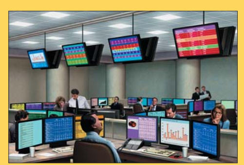
Financial. In the fast-paced financial market, information needs to be relayed in real time. The LCD3000 is capable not only of displaying on-the-fly market data and other vital information without distortion, but does so using crisp text and a high-bright backlight for easier readability.

Intelligent power management ensures a smart investment. Utilizing energy-efficient technologies in its design, the LCD3000 reduces power consumption and significantly lowers the total cost of ownership (TCO). The high-efficiency backlight reduces not only the power consumption but also the heat generation at the front of the screen.