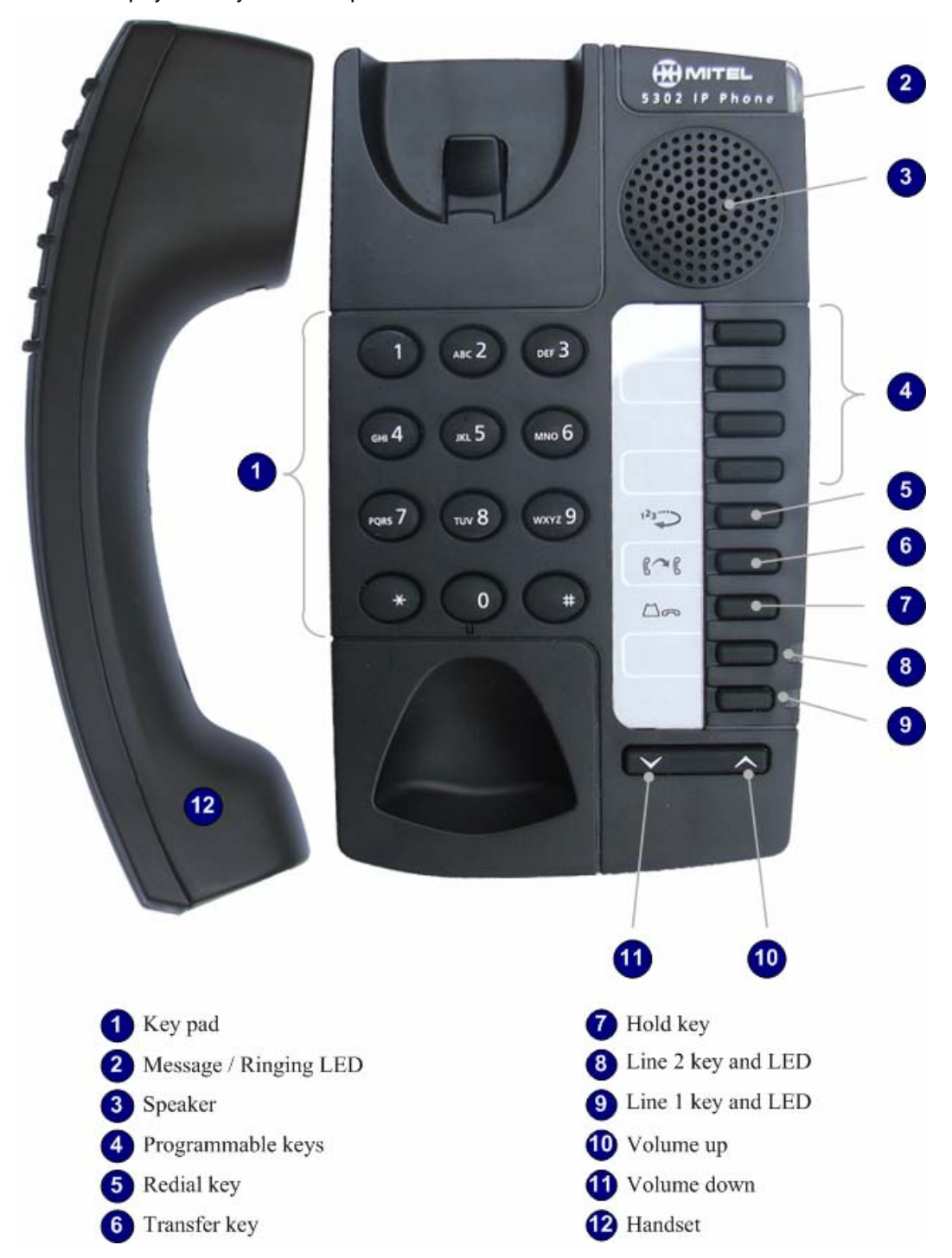
Figure 1: Physical layout of the Mitel 5302 IP Phone

Figure 1 shows the physical layout of the phone.