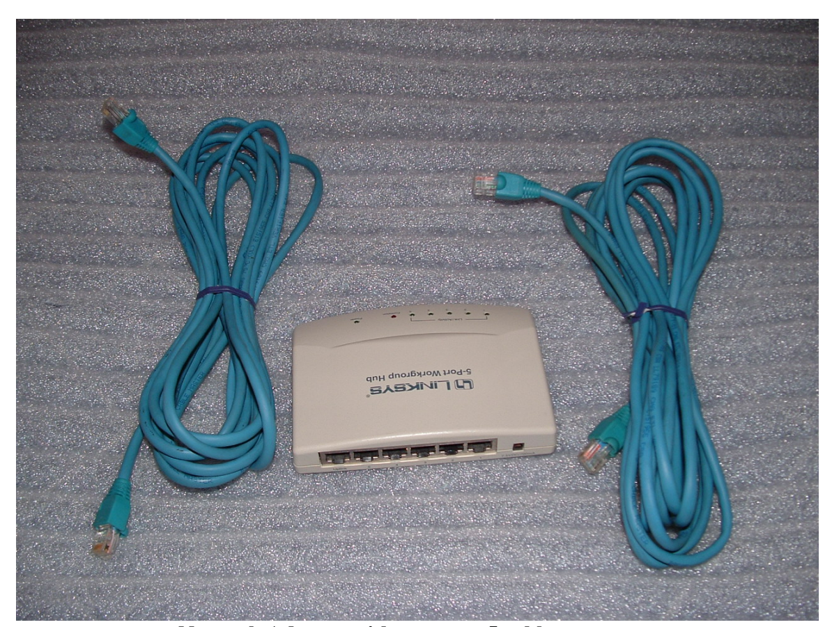
Network Adapter with category 5 cables

The picture above shows an example of a 5 port hub. One computer and up to 4 scales can be connected for programming.