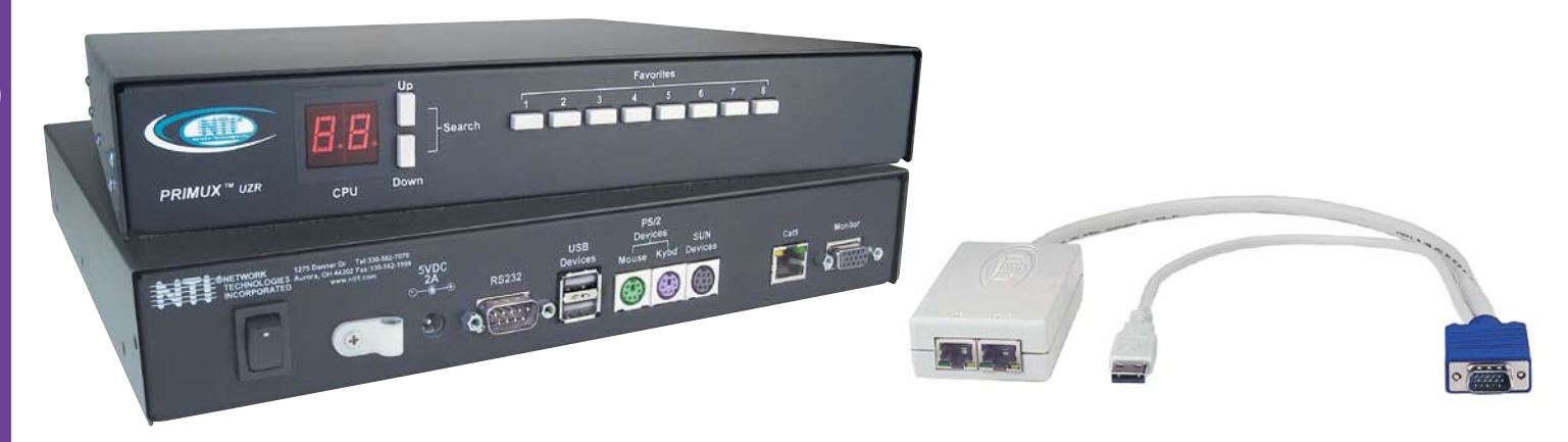
PRIMUX-UZR (Front and Back) and HA-USB Host Adapter