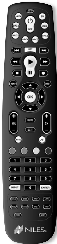
Figure 1. Niles R-8L Hand-Held Learning Remote Control

The Niles R-6L and R-8L hand-held learning remote controls are used as source controllers for Niles MultiZone receivers (ZR-4 and ZR-6 respectively). They come preloaded with ZR-4/ZR-6, ZR-PRO and many other popular component commands, and can learn virtually any IR code for enhanced source operation from any zone.