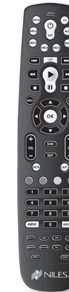
HAND-HELD LEARNING REMOTE CONTROL