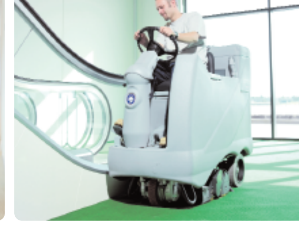
TAKING CARPET CARE TO THE ULTIMATE LEVEL