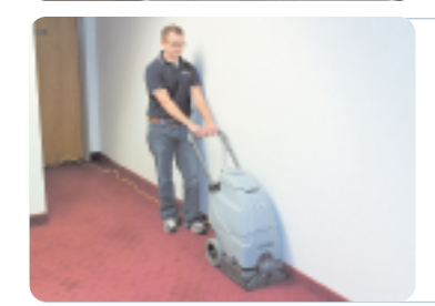
The AX 310/410 - intelligent options for cleaning carpets in mid-sized area.

Fast and effective dirt extraction from carpets is the name of the game. Thanks to the intelligent design and quality engineering that are the hallmark of all Nilfisk machines, the AX 310 and AX 410 are ready-to-go, reliable and simple to use.