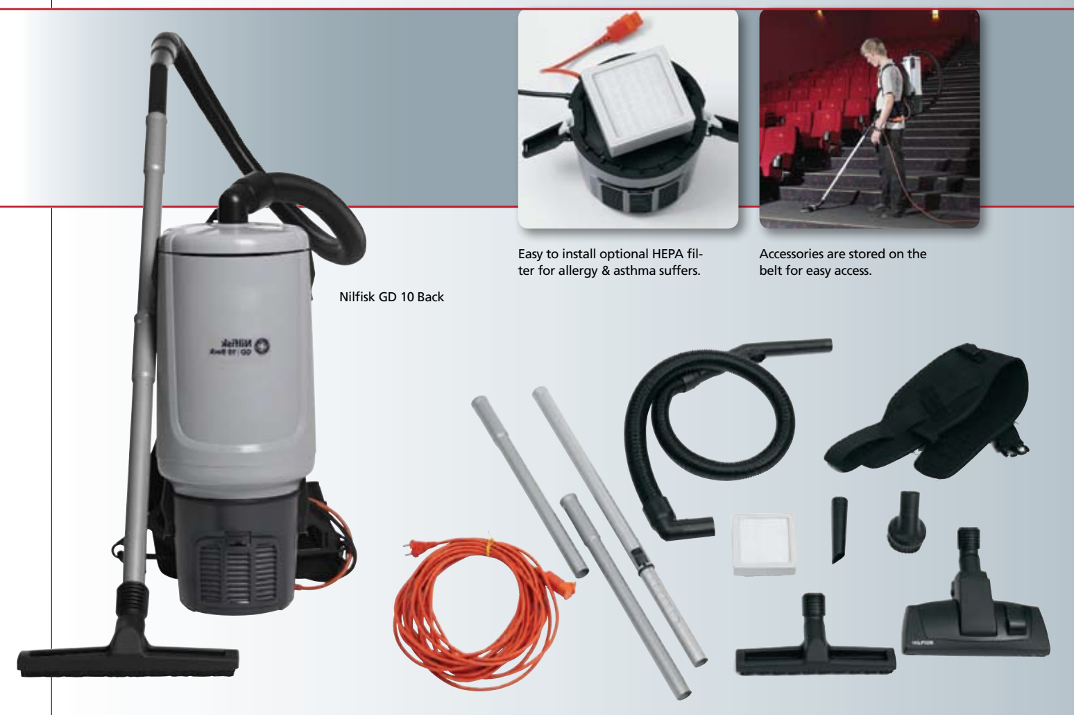
Wide selection of accessories available to meet specific applications.

The Nilfisk GD 5/GD 10 backpack vacuums surpass all criteria, with technical advancement that shows in every Nilfisk product, making fast productive cleaning at a price that won't bust your budget.