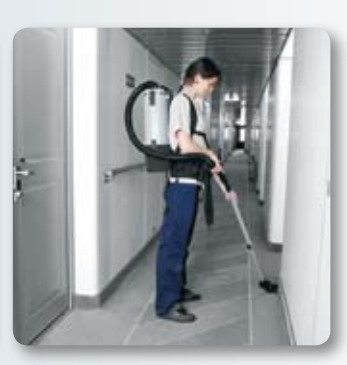
For convenient cleaning of those hard to reach places, the GD 5/GD 10 backpacks are the answer