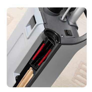
The clever design of the GU upright series includes carefully thought out onboard storage places for all accessories