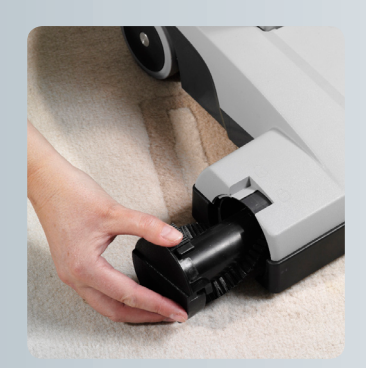
The brush is easily accessed without the need for tools for easy replacement, maintenance and cleaning