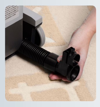
Easy access to suction hose for removal of any blockages that may arise