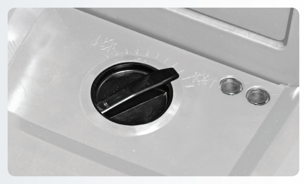
Indicators guide the user