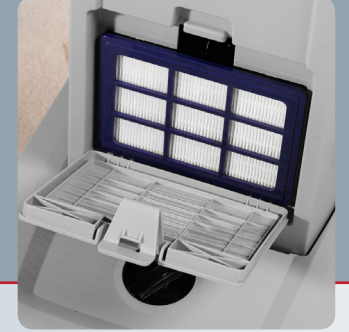
A HEPA 13 filter is optional for all models in this series so that the machine can be used where maximum dust filtration is required