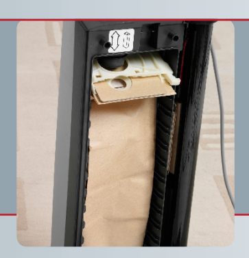
The dust bag is 'universally' sized and is easy to interchange