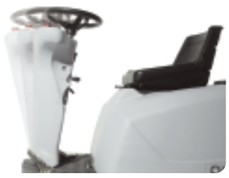
The steering column adjusts for easy access to the machine and for maximum operator comfort.