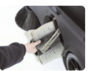
The filter and brushes can be accessed quickly and easily without tools for service and replacement.