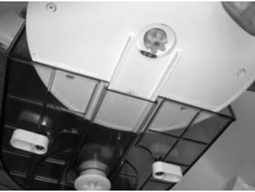
Aluminum/auger mixing mechanism in mixing chamber, and being lifted out

6. Now remove the white lid with the motor chuck off of the auger. (See Below)