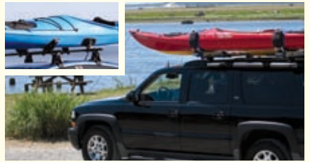
Right-side up using a Hullavator, inset using saddles

shape, color and UV-protection. Storage is key!