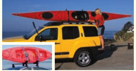
On the side using Stackers, inset using J-style