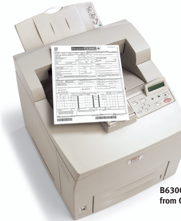
B6300n Digital Mono printer from OKI Printing Solutions

The solution enables schools to migrate from hard copy pre-printed forms into an electronic format for more efficient processing and distribution.