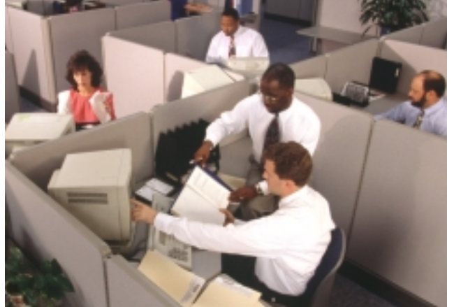
With the factory-configured OkiLAN 310e+ or optional OkiLAN® 6010e print servers, the OKIPAGE® 12i Series is perfect for small offices or small workgroups.

to handle the multiple demands of shared printing.