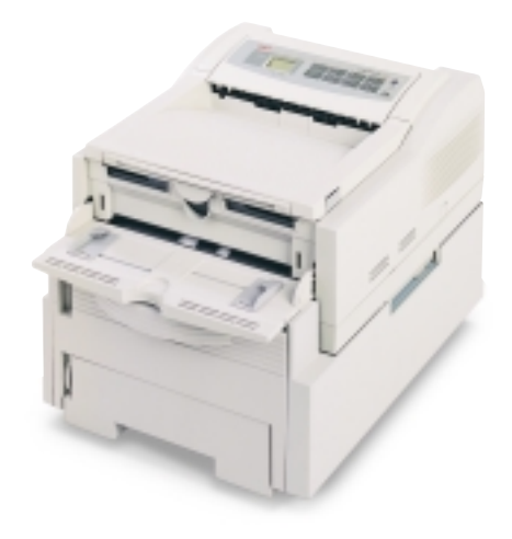
The network-ready OKIPAGE 12i/n (shown with standard 750-sheet paper capacity) ships with the OkiLAN® 310e+, a multi-protocol 10-Base T internal Ethernet® print server that delivers fast, simple and reliable network printing.

OkiLAN Ethernet® print servers support all major operating systems and are compatible with most custom and off-the-shelf software — so your OKIPAGE 12i Series output looks good in the most popular environments.