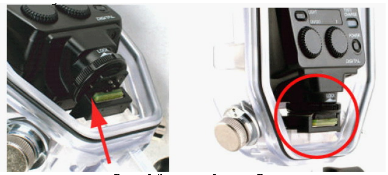
FIGURE 3: SLIDE IN AND LOCK THE FLASHLIGHT

Turn the lock ring follow the direction "LOCK". Take care not to excessively tighten the screw. Note: If you find that control levers do not locate properly with the buttons, please check again that the flashlight is properly seated to the limit of the guide rail.