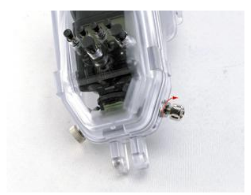
FIGURE 4: REPLACE THE LID