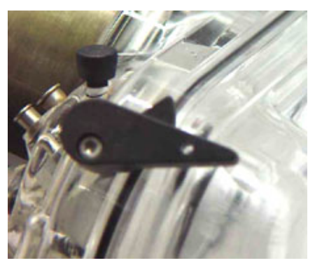
Cam Lever in Housing