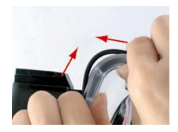
FIGURE 2: PROVIDING A LOOP IN THE GASKET