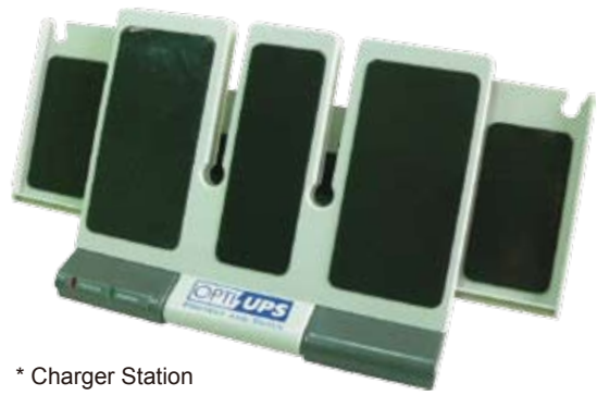
* Charger Station

Charger Station / Silicone Power Battery / Power Bank / Master/Slave / Dual Green Power