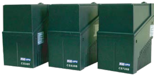
* CS385B / CS530B / CS730B