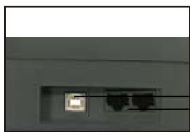
USB RJ11 RJ45