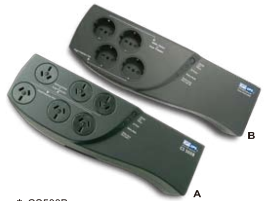
* CS500B A. Australian Standard B. German Standard