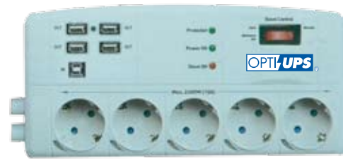
* Master / Slave