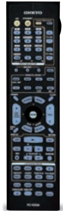
Available in Silver or Black