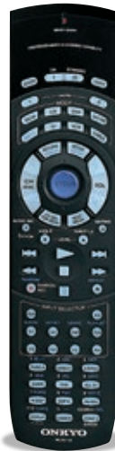
Powerful backlight/preprogrammed learning remote with mode-key LEDs