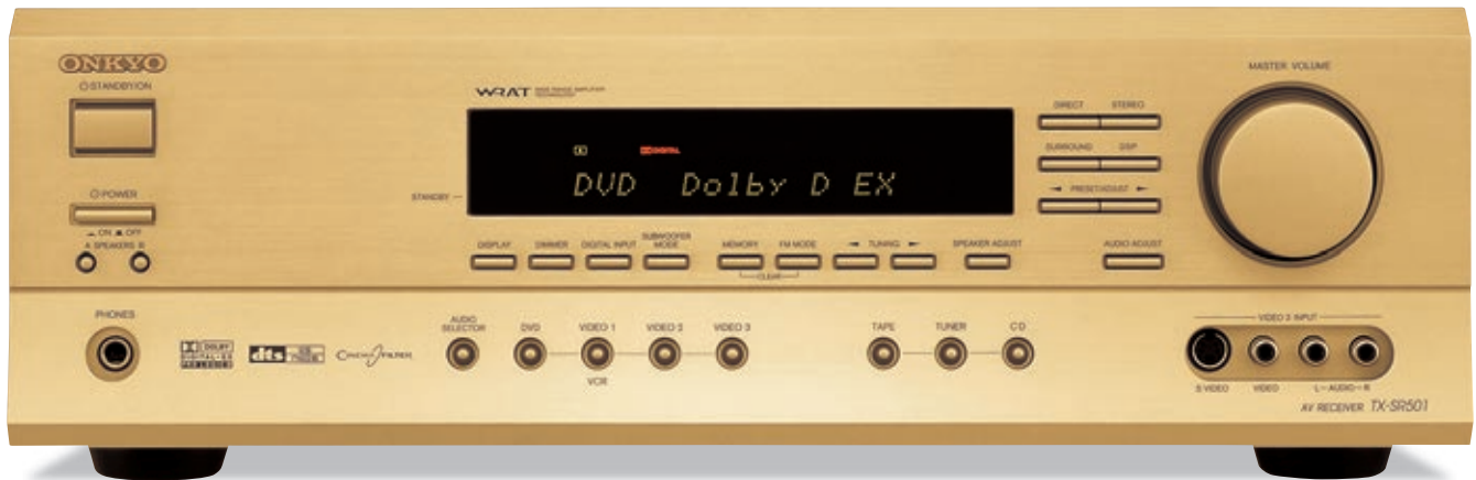
Available in Gold or Black