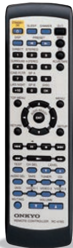
Full-function RI Remote