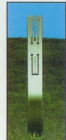
P/SS36 Stainless Steel Stake