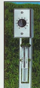
Volume Control and Stainless Steel Stake Sold Separately