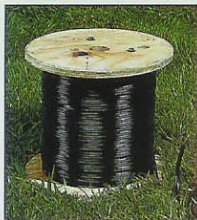
BW144 & BW142 Professional Burial Wire