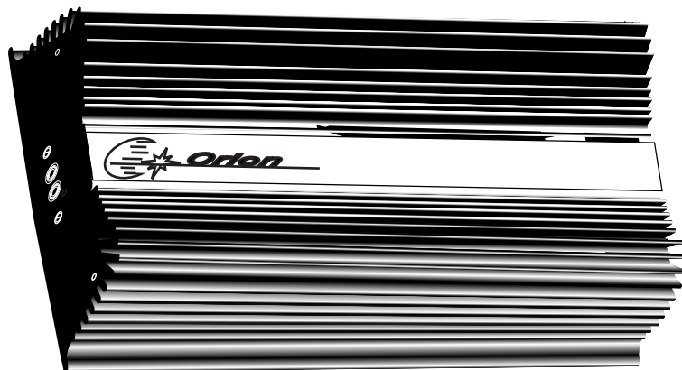
End Panel Diagram

Green = Rear Left Positive Black/Green = Rear Left Negative White = Rear Right Positive Black/White = Rear Right Negative