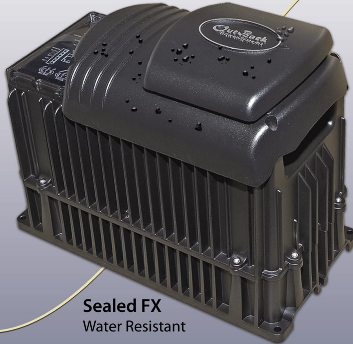
Sealed FX Water Resistant