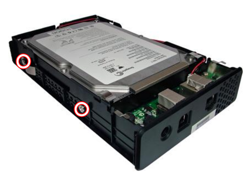
Fig. 3 Removing the hard disk drive screws.

Note: One of the screws on each side of the hard disk drive holds a spacer clip.