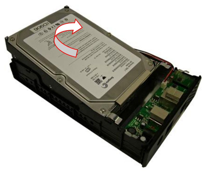
Fig. 4 Removing the hard disk drive.

2. Slide the hard disk drive towards the front to disconnect it from the I/O board.