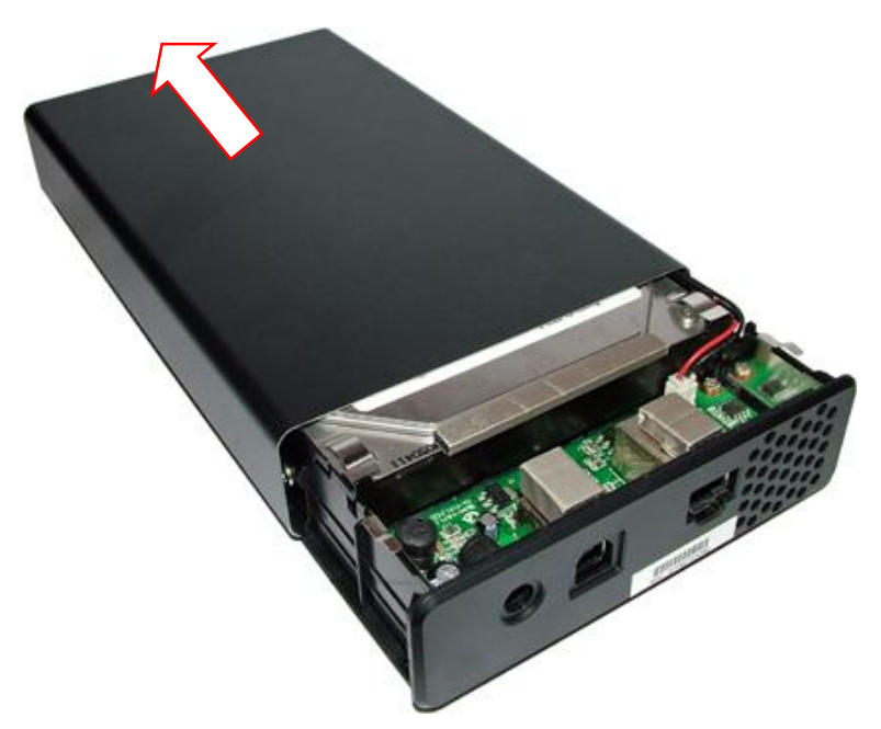
Fig. 2 Removing the top cover.

2. Slide the top cover to the front of the device and remove the cover.