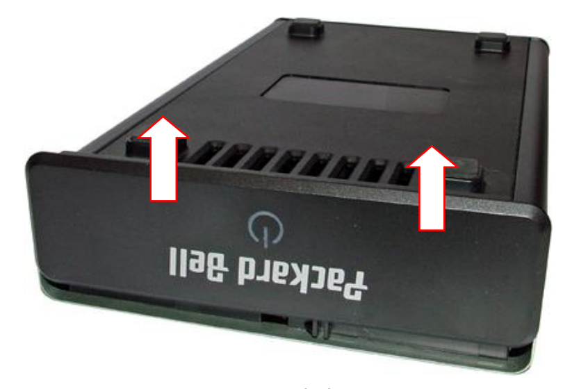
Fig. 1 Removing the front cover.

3. Insert a flat-blade screwdriver in the 2 orifices to release the front cover and slide the cover up and out of the compartment.