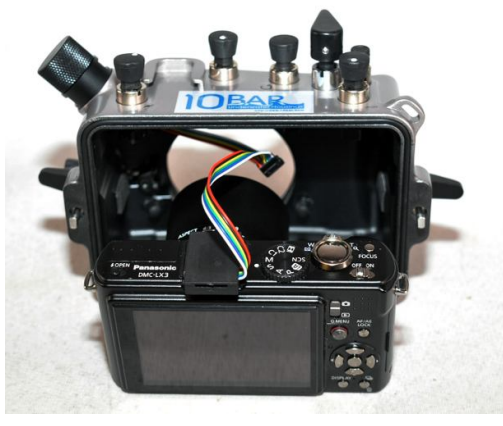
d. fix the Converter Lens