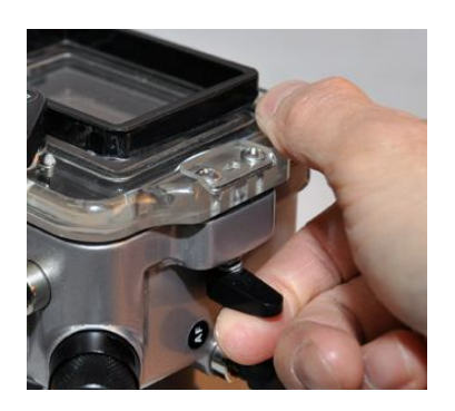
Turn the lever towards the wall of the housing and check the key is at lock position