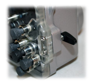
Pull out the lid by holding on the grip near the lock.