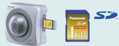
Image recording function

Images captured by the network camera can be recorded directly onto an SD Memory Card (sold separately). *Voices cannot be recorded.