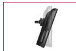
Tilt allows adjustment of +15/-5°

STANDARDIZED COMPATIBILITY VESA® 75/100, 200 x 100 and 200 x 200mm compliant