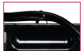
Integrated cable management