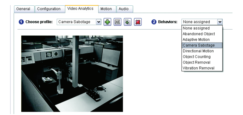
Figure 4. Selecting a Behavior

5. Click OK. The new profile name appears in the "Choose profile" list.