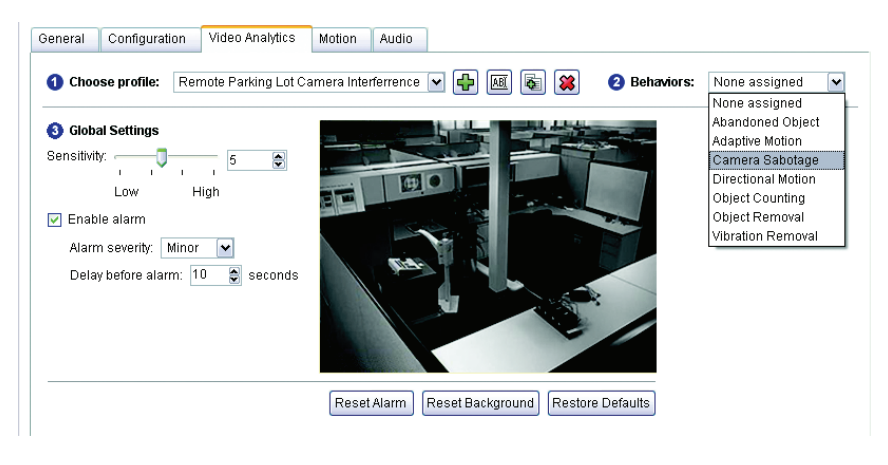
Figure 2. Video Analytics Tab

Click the Add Profile button to open the Add Profile dialog box. A message appears: "This action will deactivate the current profile. Do you wish to continue?" Click Yes to continue.