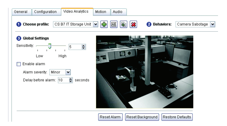
Figure 5. Camera Sabotage Settings

Select Camera Sabotage from the Behaviors list (refer to Figure 4). The Global Settings area of the screen displays the required settings for this behavior.