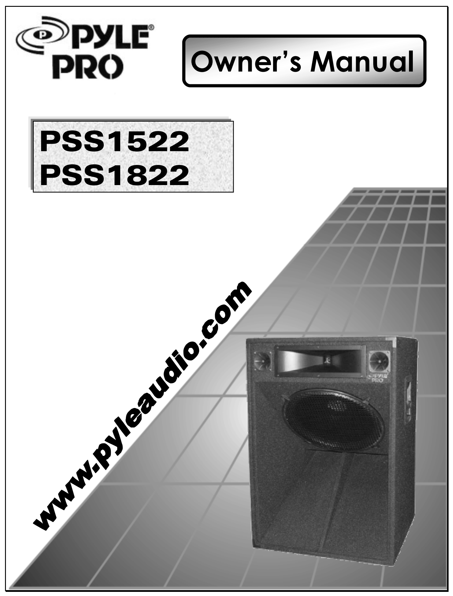
Download from Www.Somanuals.com. All Manuals Search And Download.