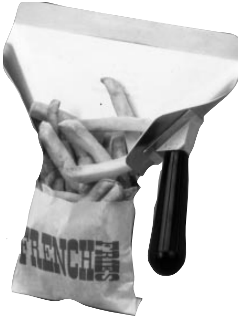
Model 152-ARN (Right-Handed)