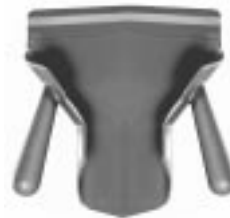
Model 252-DH (Dual-Handed)