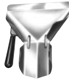
Model 152-ALN (Left-Handed)