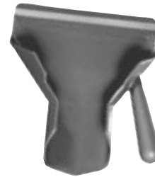
Model 252-RH (Right-Handed)