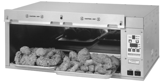
DHB-34 Dedicated Holding Bin