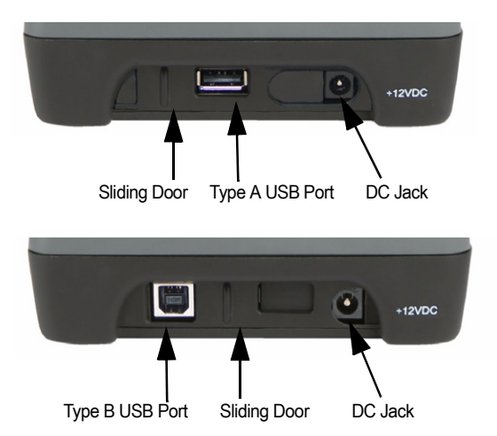
Figure 3.1 Desktop Docking Station Rear View

Move the sliding door selector to alternate between the Type A and Type B USB ports.