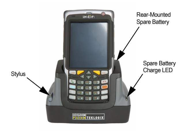
Figure 2.1 Desktop Docking Station Front View