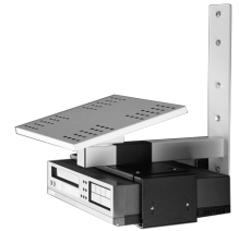
VCR-1418S shown with MMH/D-15