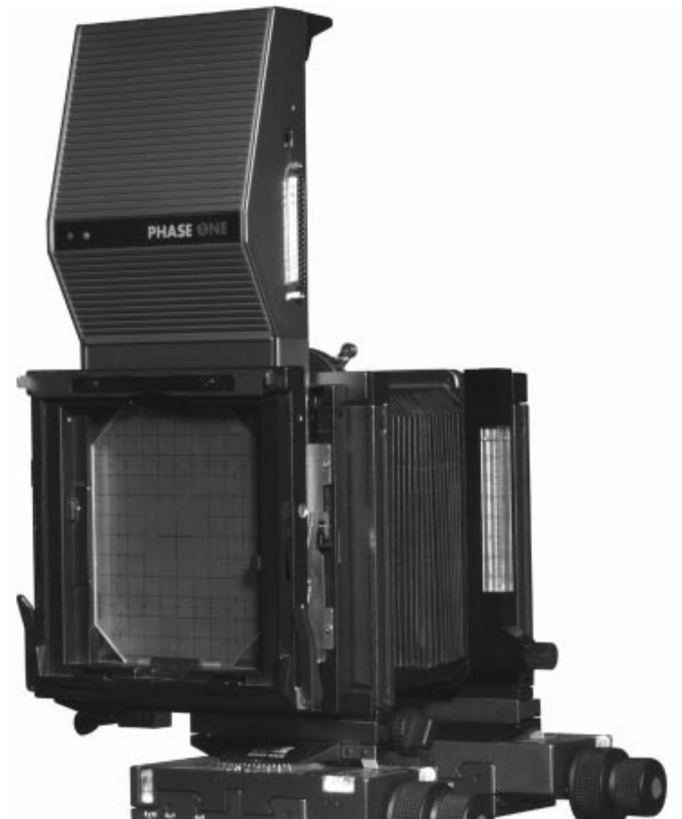
Fig.2 PhotoPhase camera back mounted on a Sinar camera